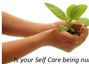
Is your Self Care being nurtured?

This year, I would like to make a challenge. Rather than establishing unrealistic goals for 2012, let's focus on our own well-being. The holidays are now over, we have survived the sweets, the sometimes stressful family interactions, and now it is time to focus on ourselves.